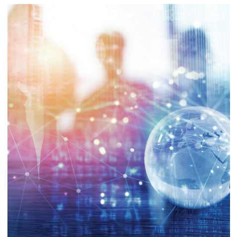
Environmentally Friendly Global Distribution: Lyophilized products are not constrained by supply logistics.

Our team can provide a variety of materials and biologics to meet functional and cost requirements for each custom project. We can manage the supply chain for your enzymes and other components as needed. Custom products may draw on the NEB portfolio of enzymes and biologics and the combined expertise across our organizations to provide your specification lyophilized from a single provider.