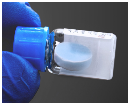
LyoPrime Luna™ Probe One-Step RT-qPCR Mix with UDG (NEB #L4001)

As noted previously, the amount of material that can be dried in a single freeze dryer is dependent upon the specifications of the dryer, but also by the primary packaging footprint. Product height plays a lesser role, provided it does not impact the