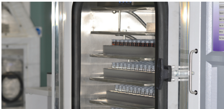
A typical freeze dryer

Depending upon your product needs, NEB Lyo Sciences can carry out functional and materials testing. Functional testing of custom products verifies post-drying performance. NEB Lyo Sciences has thermocyclers and lab automation tools to qualify your products as soon as drying is completed. Materials testing may include residual moisture determination using Karl Fischer analysis. This provides important infor-