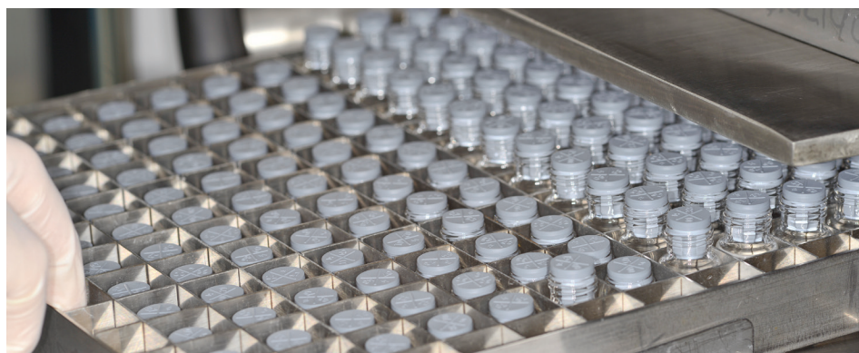
Glass vials are ideal for reagent manufacture: glass is impervious to both oxygen and moisture